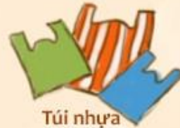
Túi nhựa 10 - 20 năm