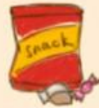
Vỏ snack, bánh kẹo 10 - 20 năm