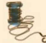
Dây câu 600 năm